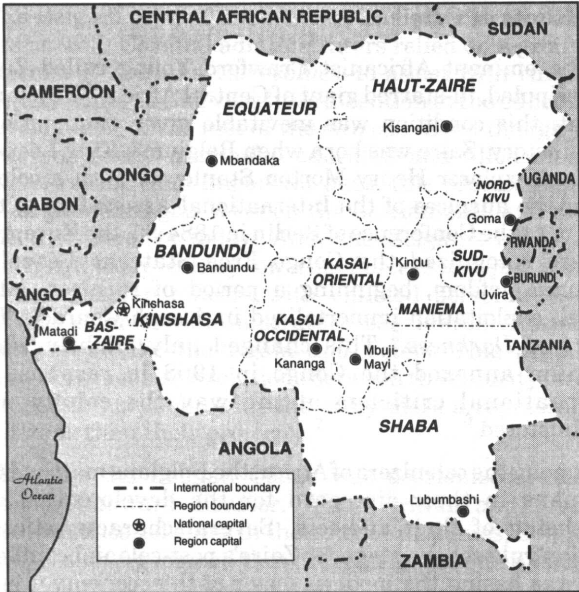
Figure 2. Map of Zaire.

failure of reform, coherent and creative strategy is imperative. If the United States is to both encourage reform in Zaire and prepare for multinational relief if reform fails, the U.S. Army may have an important role and thus should actively seek to augment its understanding of reform, crisis, and security in Zaire.