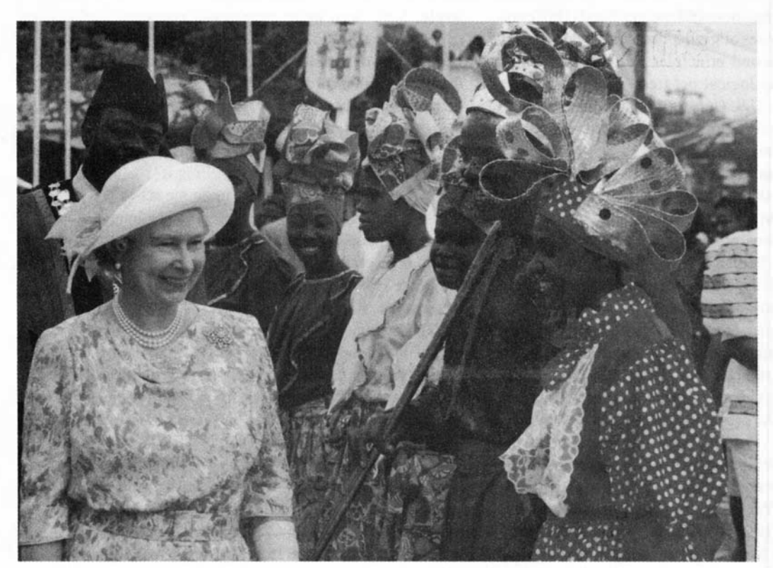
Queen Elizabeth II during a visit to Jamaica. The Queen is one of the most wealthy people in the world, and, contrary to popular mythology, she is also one of the most powerful.

majority of nations of the world today, there exists a deadly dangerous myth: that the British Empire has disappeared from the face of the Earth; and that Great Britain, the United Kingdom, is of little consequence in world affairs.